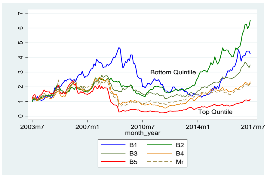
Fig. 2: Cumulative returns for five portfolios formed on prior 36-months betas

show that the arbitrage process is actively working; the opportunities are realized, the patterns disappear, and then the cycle repeats again. The highest down trend can be seen in 2008 which is the year of a major stock market fall by almost 55% in just four months, and the stock market was frozen at the level of 9144 points for 108 days.